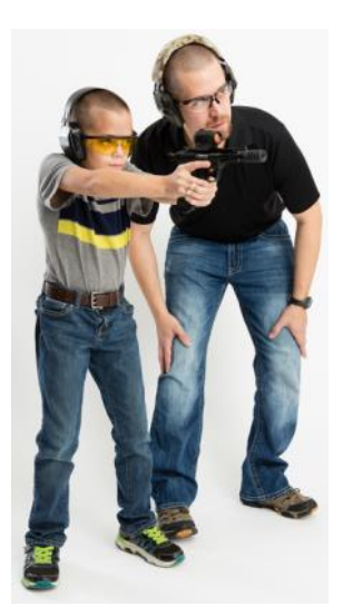
Take extra time to make sure that the lessons of safe firearms handling, use and enjoyment are passed down to the next generation!