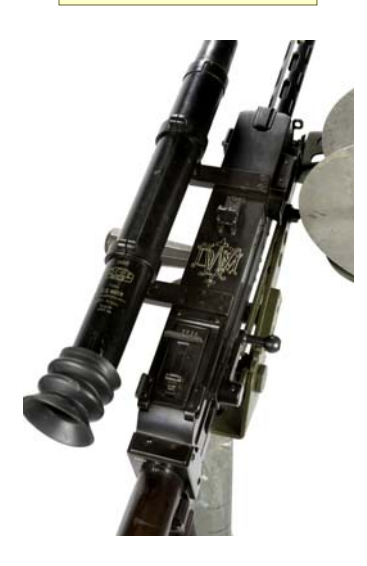
NATIONAL FIREARMS ACT TRADE & COLLECTORS ASSOCIATION®